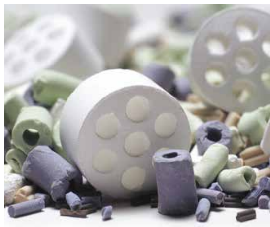
Figure NUMBER ONE

the different components interact. For this purpose they used synchrotron light in the X-ray absorption fine structure (XAFS) technique, which revealed important information about the material. The experiments showed how the nature of the Cu in the catalyst changed with varying conditions, this was valuable information in the company's development of improved industrial products.